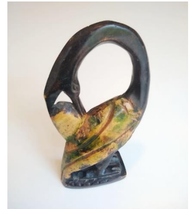
Sankofa Bird from Ghana